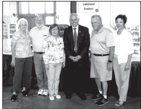
Senior Fair with Sen. Antonacci