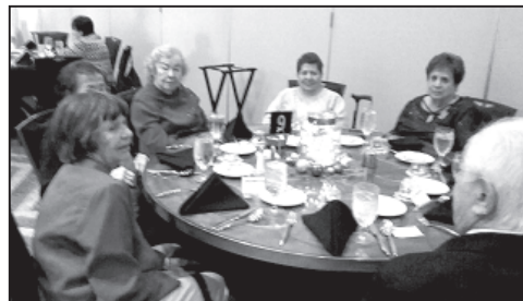
Christmas Party at Embassy Suites