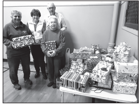
Shoe Boxes for the Kiwanis Club