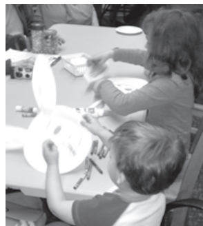
Members of the Friends of the Solvay Library and Solvay Library patrons at the annual Easter Party

Join them at their next meeting as they plan and prepare for their next fundraiser and annual book and bake sale.