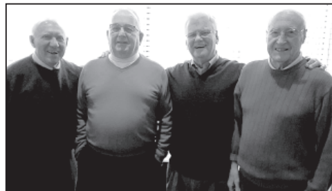
Christmas Party - 2019