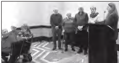
Installation of new Officers

For 2020, the January, February and March meetings will be held in the afternoon, with coffee ready at 1:30 PM and meetings starting at 2 PM.