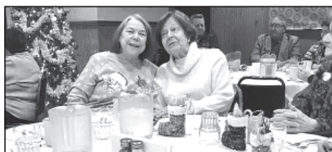
Christmas Party at Twin Trees