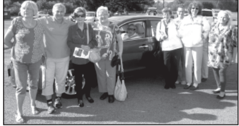
Cortland Repertory Theatre at Little York