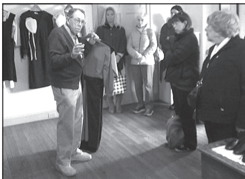
Our guide at the Amish Village - Lancaster, PA