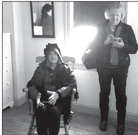
Our own Amish model!