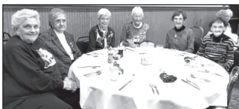
Christmas Party at Twin Trees