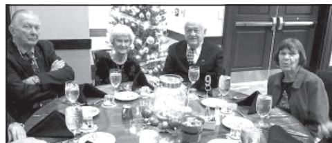
Christmas Party at Embassy Suites