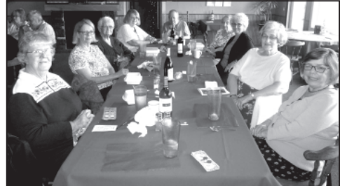
Lunch at Fisher Bay