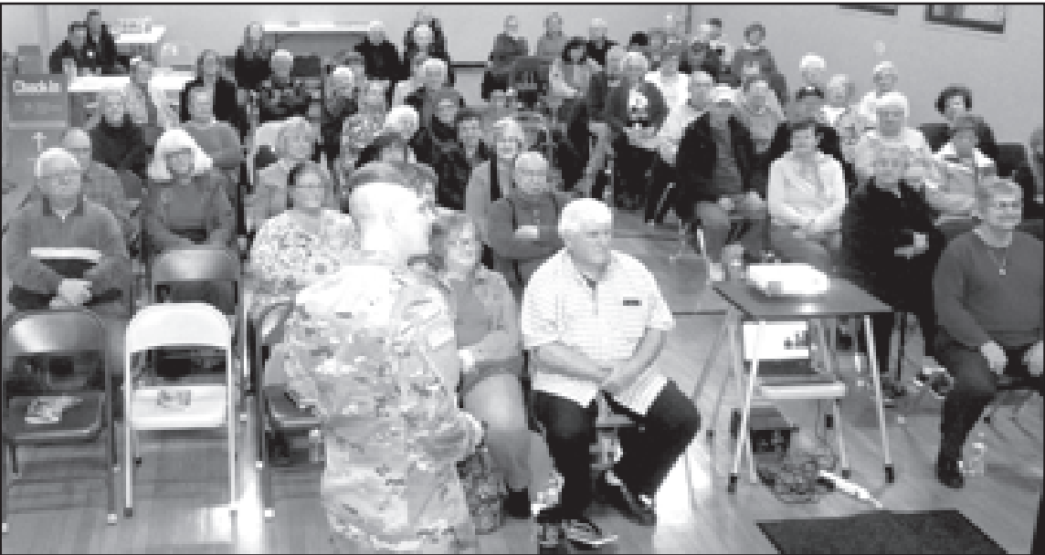
Emergency Preparedness Meeting.