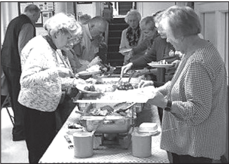
Our March Corned Beef and Cabbage Dinner!