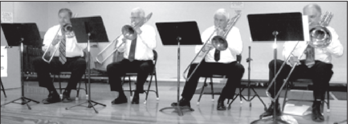
Bare Bones Quartet.