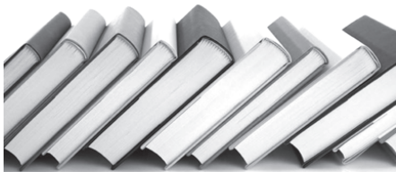
Friends of the Library Book Sale

Annual Friends of the Library Booksale , May 17-19, 2019. Our annual Book and Bake Sale, held at the Solvay Fire Department.