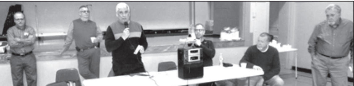
Geddes Town Officials.