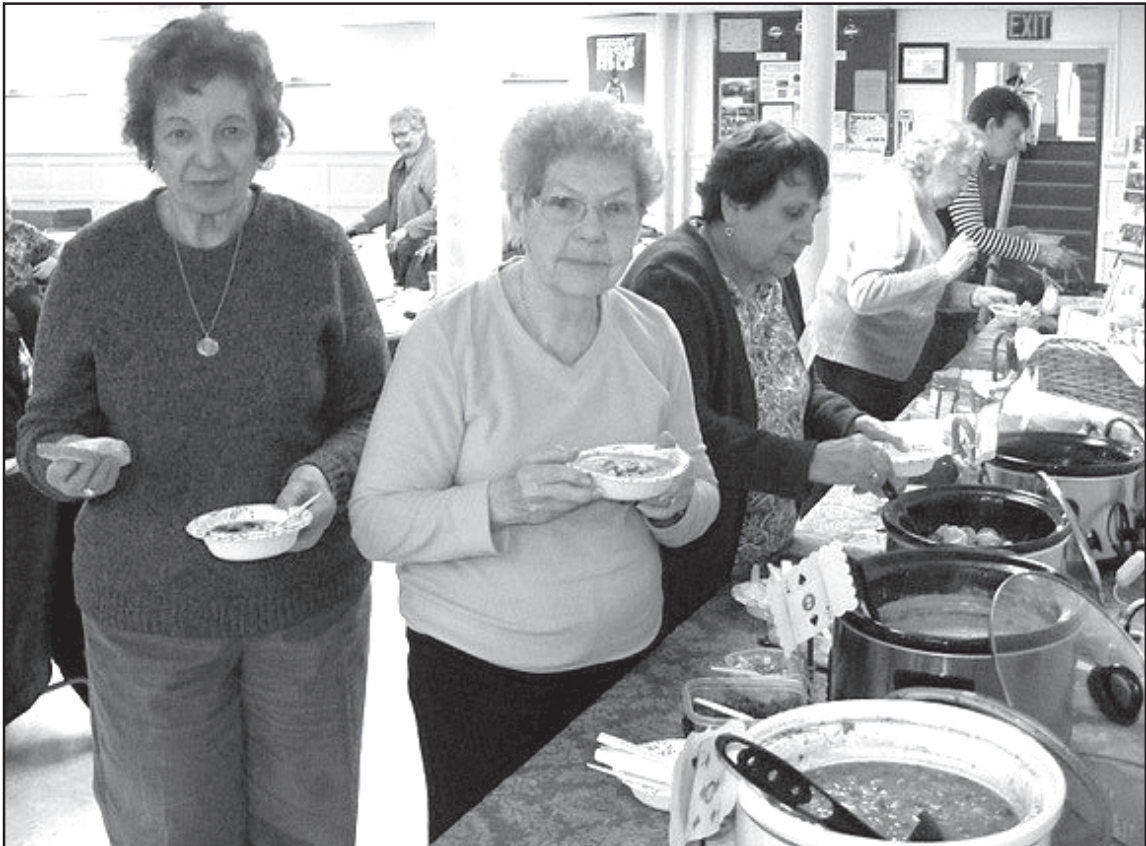
Members enjoy our "favorite soup" luncheon.