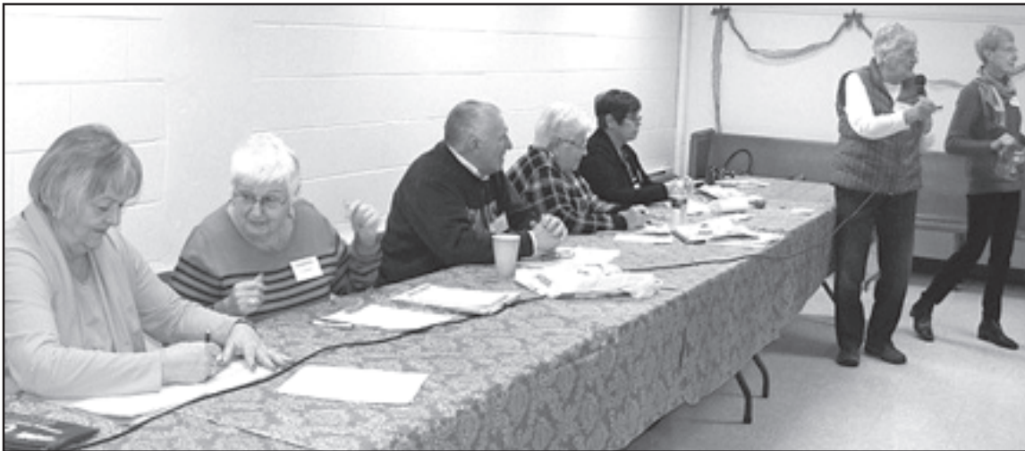
First Meeting of 2019.