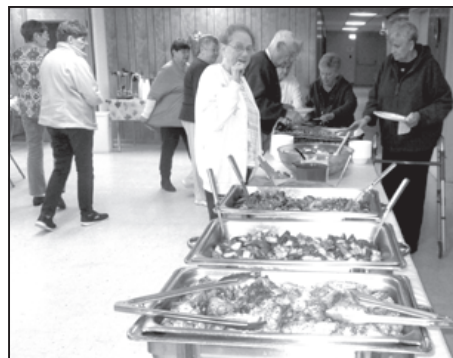
Catered dinner at Our Lady of Peace