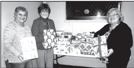
Another outstanding effort for the Kiwanis Club

Thanks to Mother Nature's early snowstorm and wet December, I still haven't been able to clear my neighbor's 5 to 6 million (give or take a couple hundred thousand) oak leaves from around my house. How they manage to get into every nook and cranny is a tribute to the east, west, north and south winds. I bought a snow-blower after the November storm but haven't needed it yet. I have a feeling the snow drought won't last.