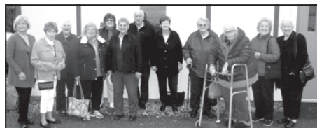
Buffet and show at Theodore's in Canastota