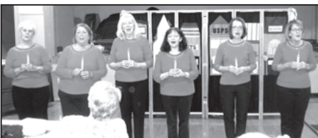
Our perennial favorites - Sentimental Serenade

At our November meeting we brought in our shoe boxes for the Kiwanis club; had Sentimental Serenade do a Christmas show for us; we went to