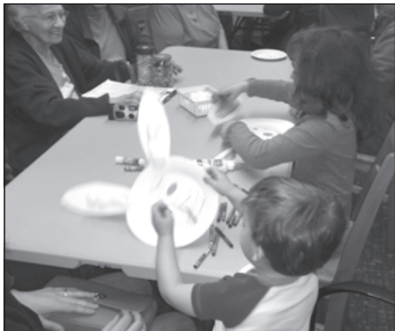
Members of the Friends of the Solway Library and Solway Library patrons at the annual Easter Party

Rapid Reads and Fast Flicks- No more waiting for bestselling book titles and popular DVDs! With Rapid Reads new books and Fast flicks DVDs on our shelves you can borrow these new, popular titles without having to put them on hold.