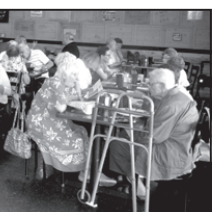
Lunch at Gracie's in Westvale