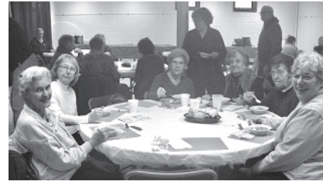
Dinner at our March Meeting