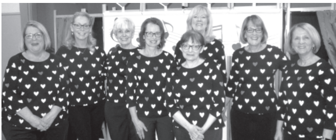
Sentimental Serenade ladies