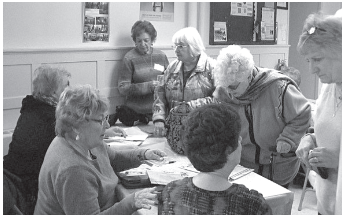
Members signing up for our many dinners!!!