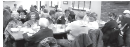
Lunch at Tony's