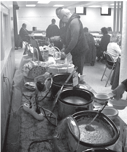
February's Annual Soup Lunch