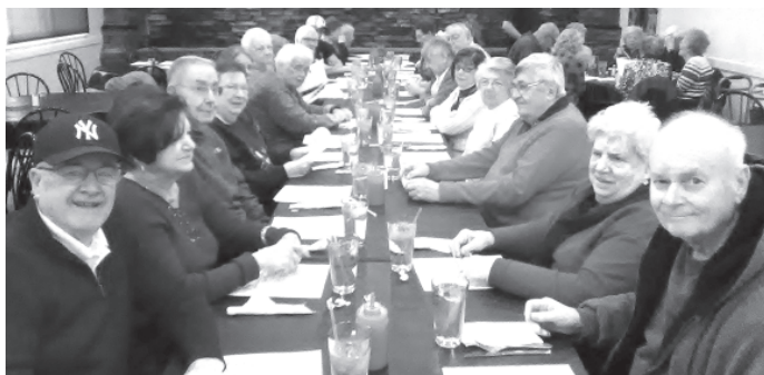
Lunch at Gee Gee's