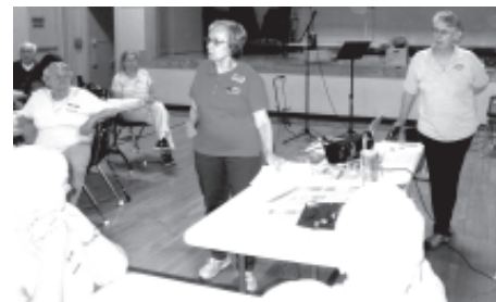
Lyme Disease speakers at our May meeting.