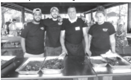
Fair Deli catered our July picnic at Lakeland Park