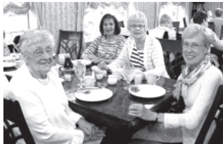
Our trip to Hershey and

An open invitation to all Seniors 55 and older residing in the Town of Geddes is extended to come and attend one of our meetings to get to know us. Our