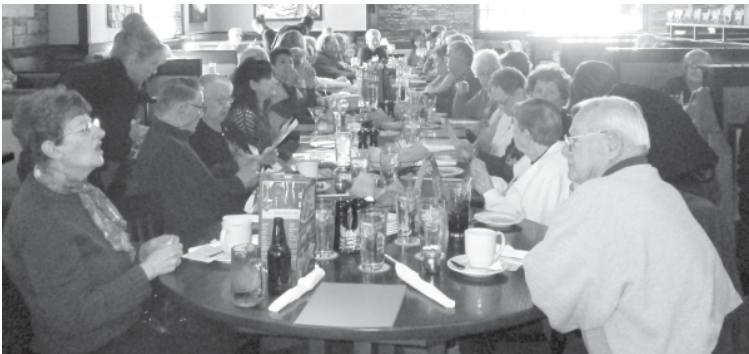
January lunch at the Longhorn at Township 5.