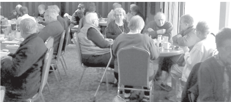
We enjoyed lunch at Pasta's on the Green at Foxfire in April.

Our meetings for the rest of the year will be on the second Wednesday of each month at 7:00 p.m. at the John Carno Recreation Center.