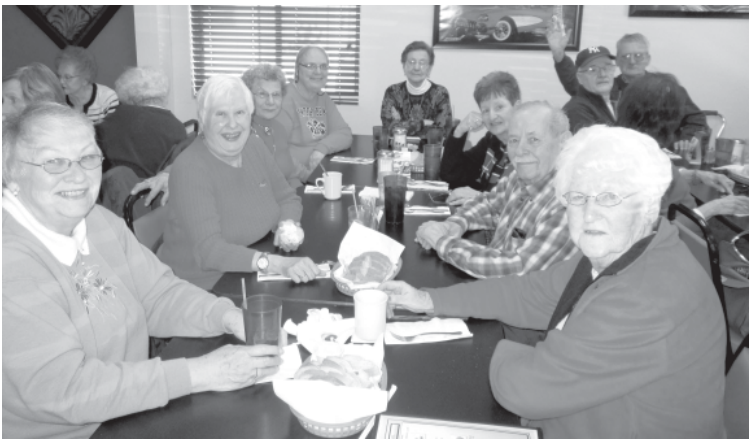
February lunch at Suzie's in downtown Lakeland.