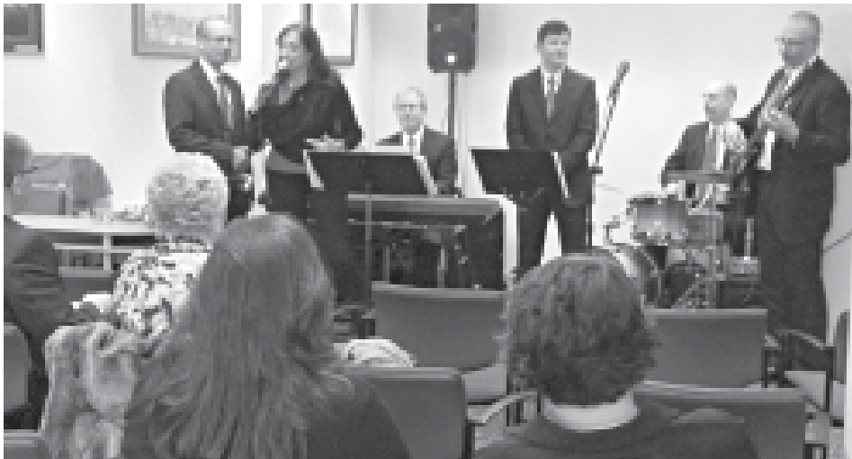
The DeSantis Band at Solvay Library celebrating Love Your Library Month in February.