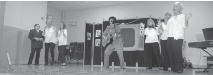
Sentimental Serenade took us back to a better day at our April meeting.