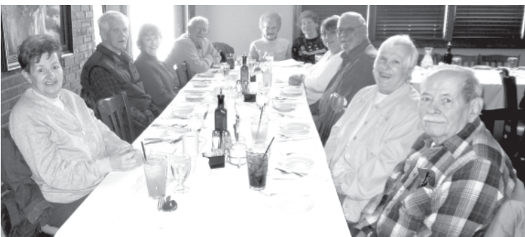
We braved the weather in March for lunch at Santangelo's.