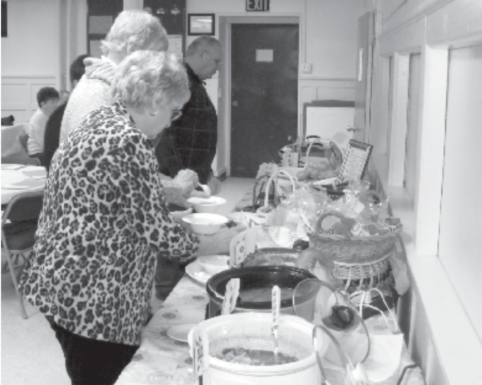
Soup night at Geddes Senior meeting on February 26 th